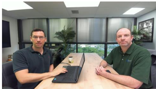
Logitech MeetUp ConferenceCam (120 degree FOV)

In the three images above, the local participants are seated ~ 36 inches away from the camera. The only difference is the camera in use to capture the local participants. While all three cameras are providing a high quality experience, the above highlights the importance of a camera's field-of-view when used in small meeting spaces.